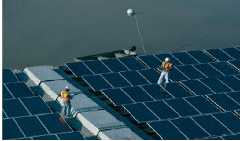
Figure 3: Worlds first Solar Power Plant

The installation is completely flexible and consists of ten one kW fibre glass modules, which make up the floating platform itself. The system is firmly anchored to the bottom of the lake and is connected to the grid using a submersible cable. The overall system is designed to last for 25 years and produce a minimum generation of 14 MWh/year. Fig 4 shows India's first floating solar power station will be launched in one of the Victoria Memorial's ponds commissioned in 2014