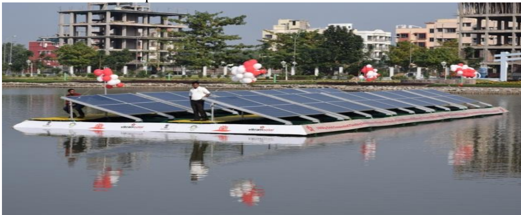
Figure 4: India's first floating solar power station installed at Kolkata

The installation is completely flexible and consists of ten one kW fibre glass modules, which make up the floating platform itself. The system is firmly anchored to the bottom of the lake and is connected to the grid using a submersible cable. The overall system is designed to last for 25 years and produce a minimum generation of 14 MWh/year. Fig 4 shows India's first floating solar power station will be launched in one of the Victoria Memorial's ponds commissioned in 2014